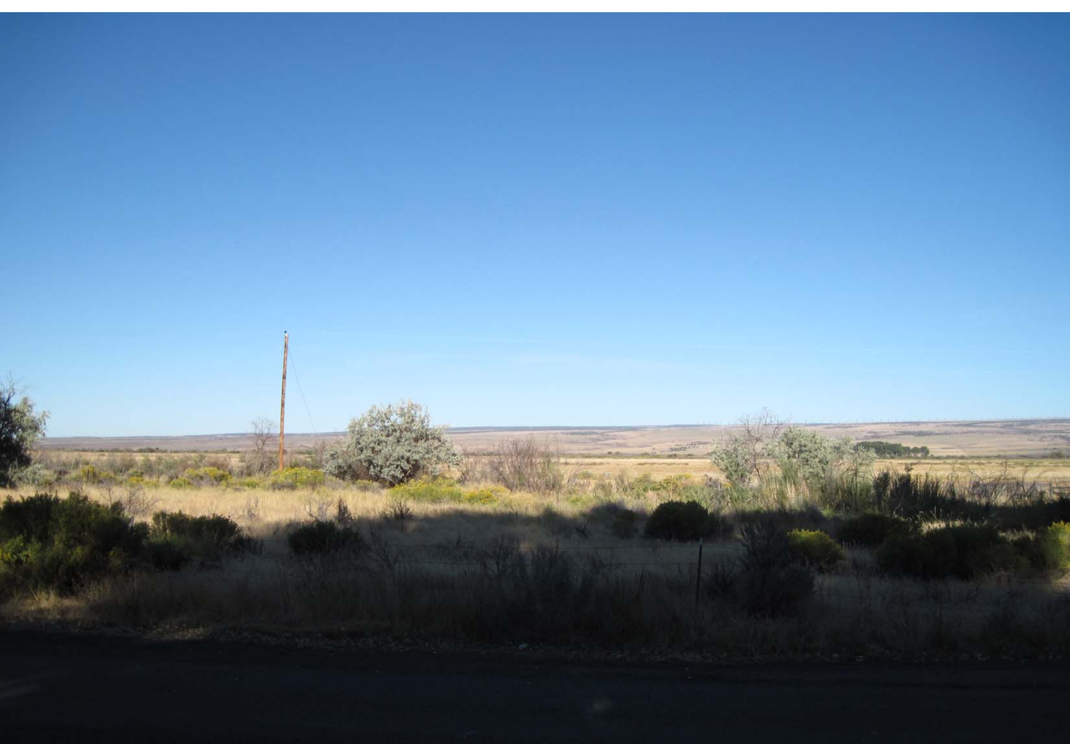
3 - Frenchglen - Looking at West Ridge Wind Project