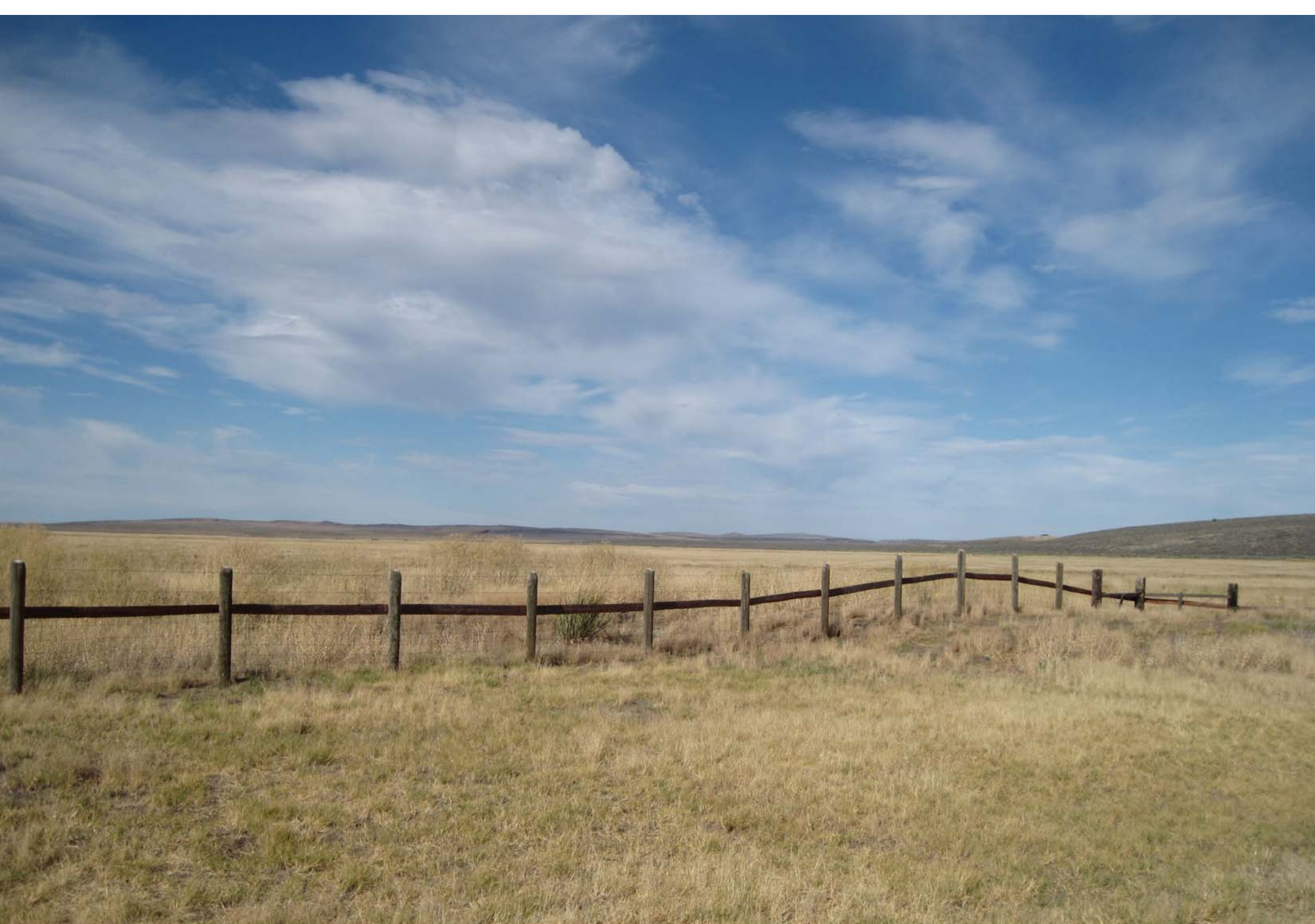
1 - Round Barn - Looking at transmission line & Riddle Mountain Wind Project