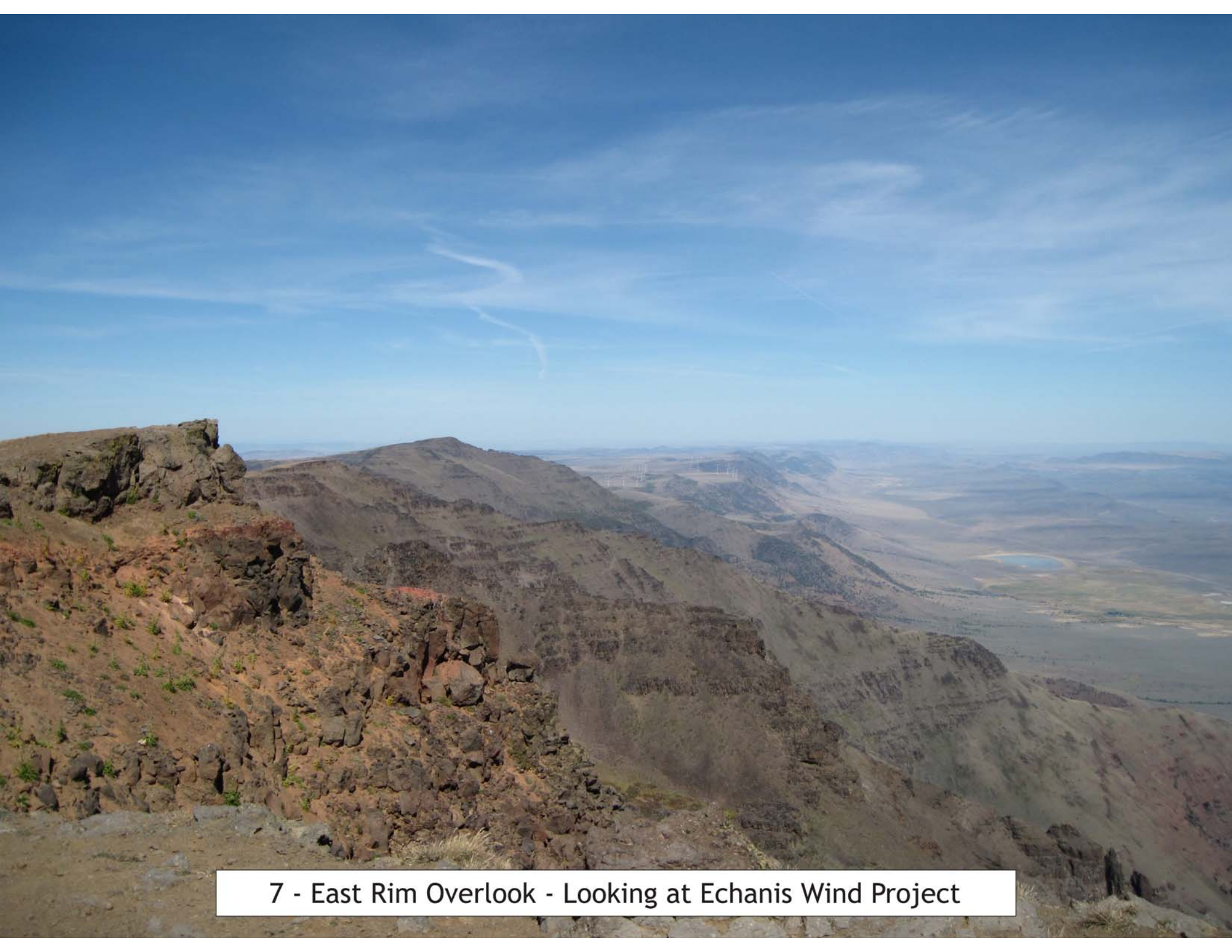
7 - East Rim Overlook - Looking at Echanis Wind Project