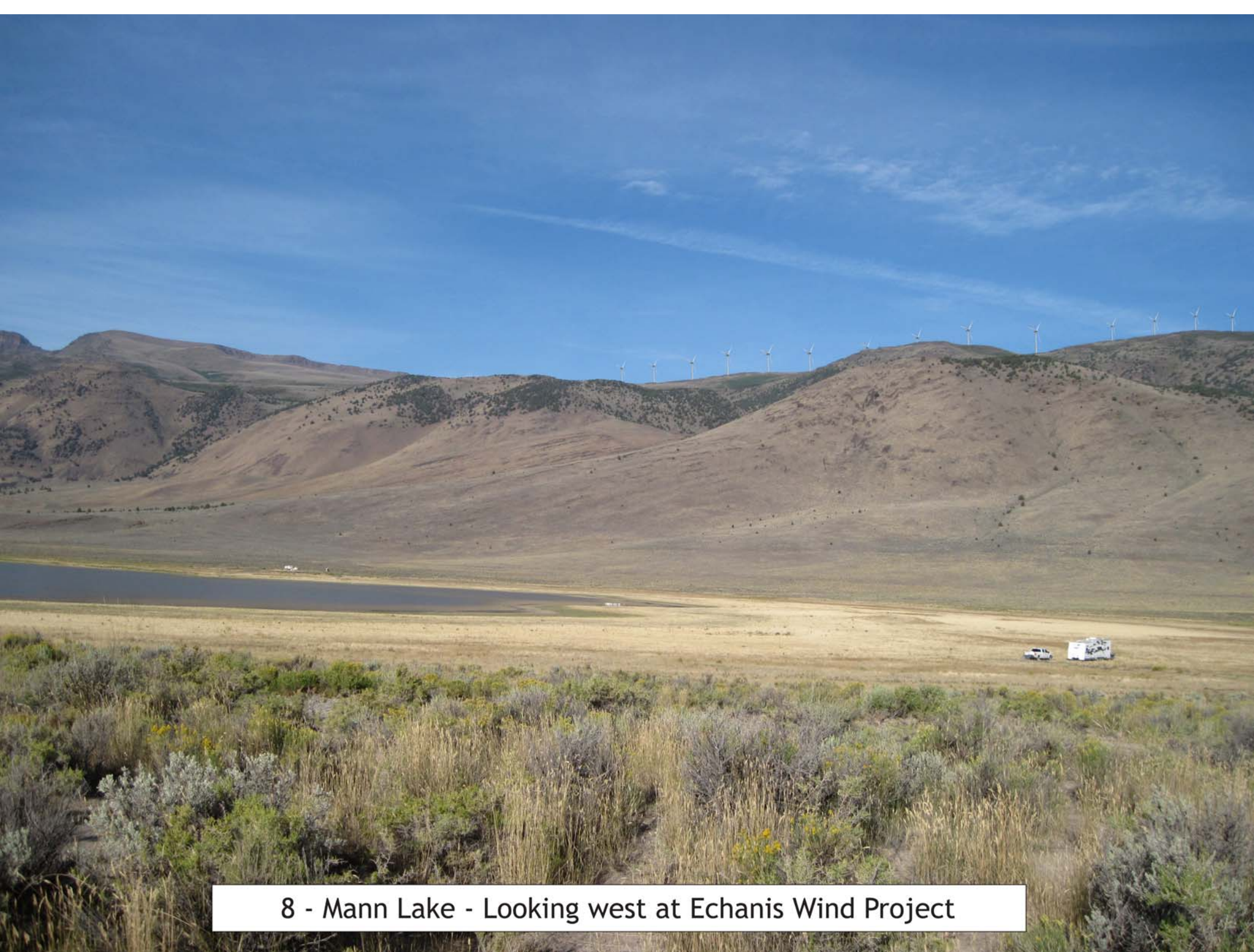
8 - Mann Lake - Looking west at Echanis Wind Project