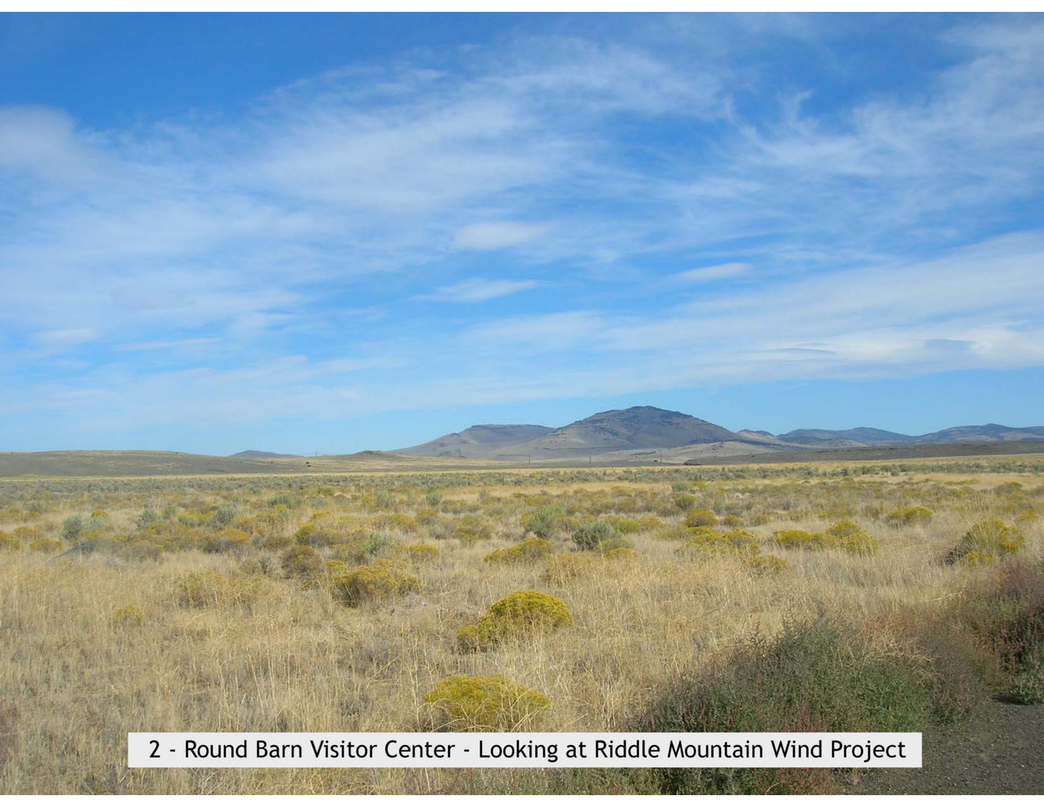
2 - Round Barn Visitor Center - Looking at Riddle Mountain Wind Project