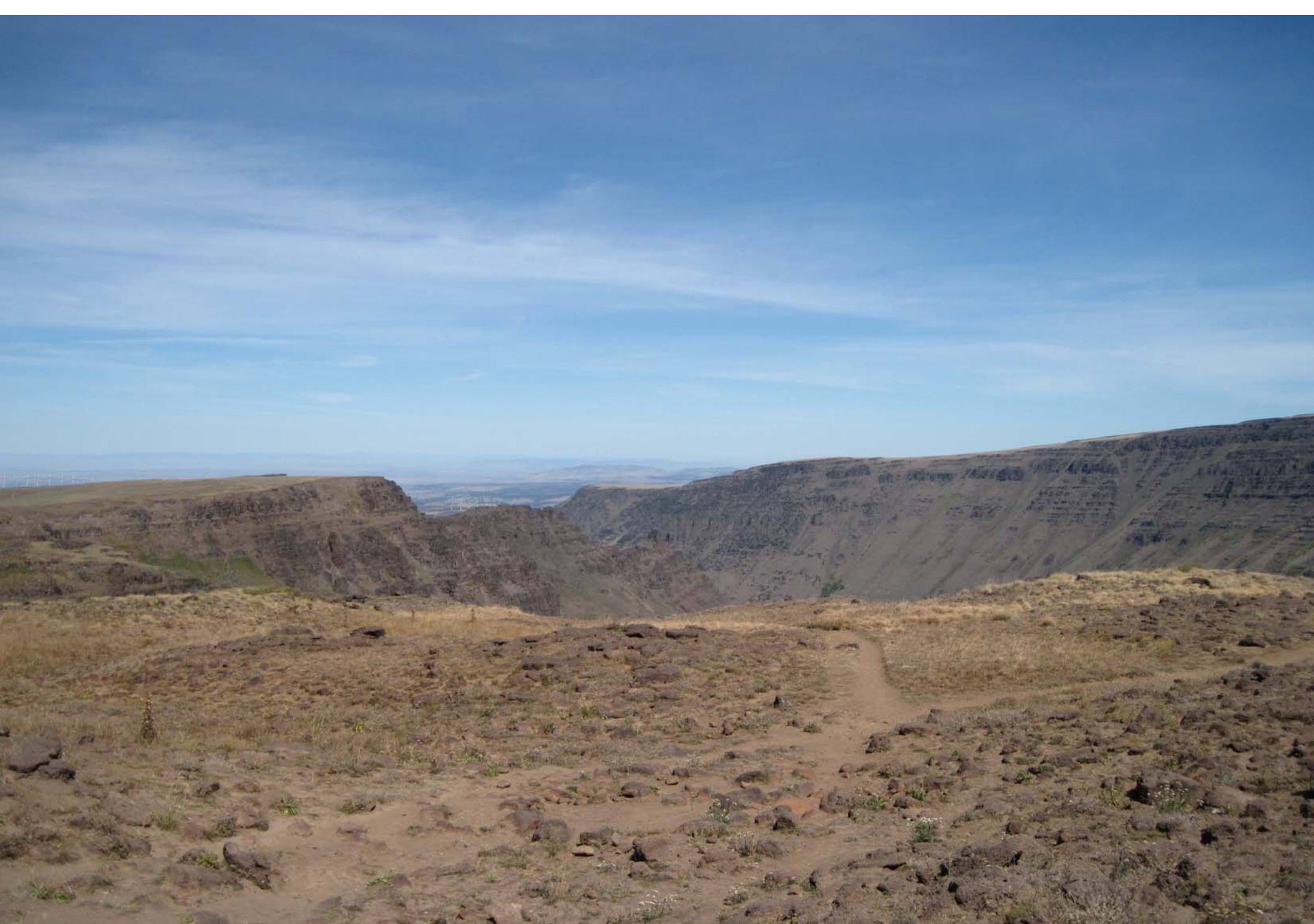
6 - Kiger Gorge Overlook - Looking at East Ridge Wind Project